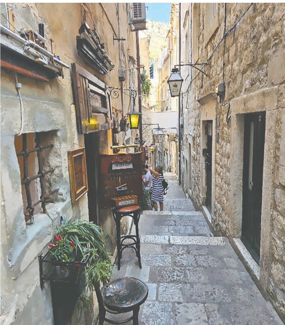
Dubrovnik, Croatia, survived an 8-month siege during its 1991-2 war for independence from Yugoslavia. The center has many historical sites, but exploring the side streets shows that people still live and work inside the city walls.