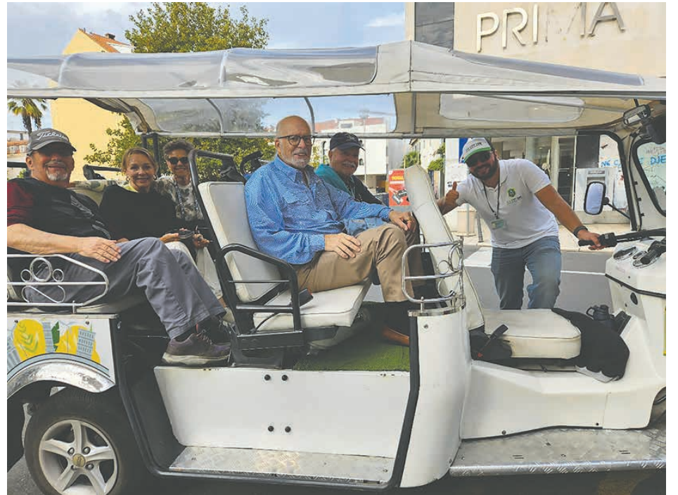
Tuk-tuks are small open electric vehicles offering personalized tours for 4-6 people. We booked this one in Split, Croatia with ecotoursplit.com . A perfect way to see this historical city.