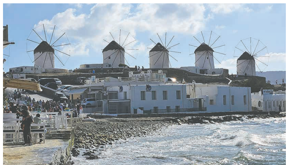
The Windmills of Mykonos were built by the Venetians in the 16th century and many were used to mill wheat until the 1950's. Mykonos is a wonderful port to just take a stroll through the city streets and enjoy a local cafe.