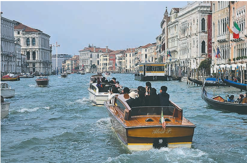
Our pre-cruise days in Venice proved easy with a 3-day unlimited tourist pass for the ferries. We chose the Riviera Hotel near the ferry terminal on Lido and were able to zip around the islands to Murano and through the Grand Canal.

Though a perfect trip rarely happens (especially on a cruise ship traveling with several couples), this trip ranked very high on our list!